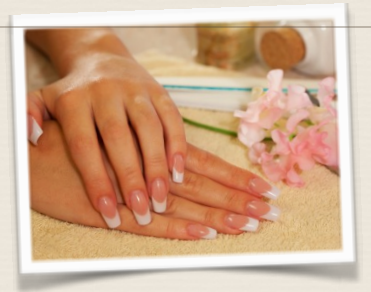
Hundreds of Colors to Choose from in Acrylic, Gel , SNS Color, Ombre, Gelac, Seashell